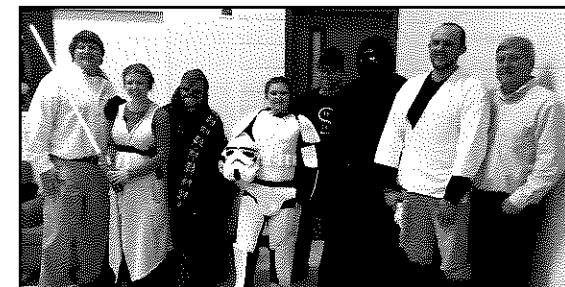
Club Drama Team